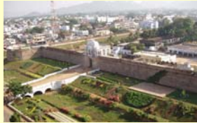
Over View of Kota