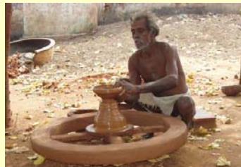
A Potter at his wheel