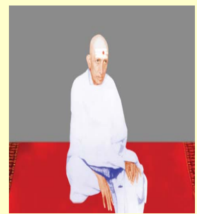
Tata Subbaraya Sastry