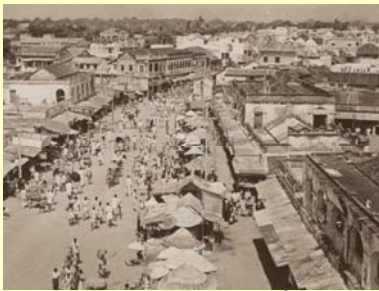
Overview of 20 th Vizianagaram