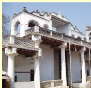
Bobbili Kota Entrance