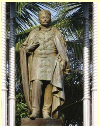
Anada gajapathi raju