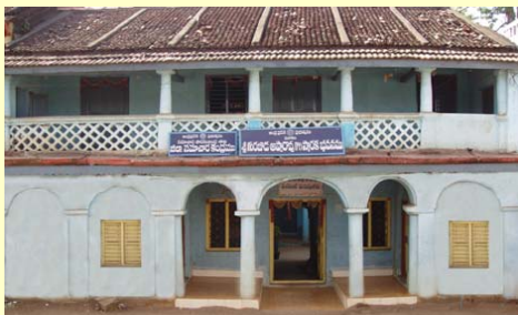
Residence of Gurajada