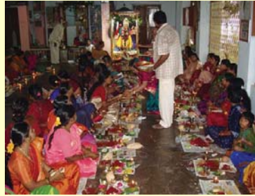
Dasra performed collectively